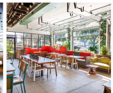
HEARTBEET AT HUNGRY'S MEMORIAL