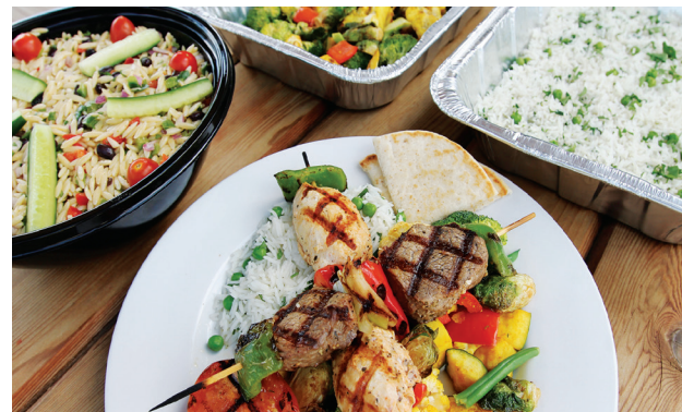
BEEF TENDERLOIN & ALL NATURAL CHICKEN KABOB