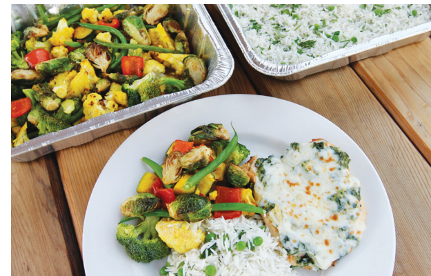
ALL-NATURAL GRILLED CHICKEN FLORENTINE

mushrooms, zucchini, bell peppers, onion